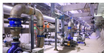
Suction pumps for the membrane tank